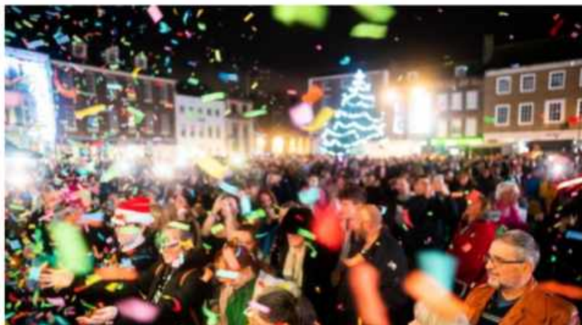
King's Lynn Christmas Lights switch-on

Sunday 26 November, Tuesday Market Place