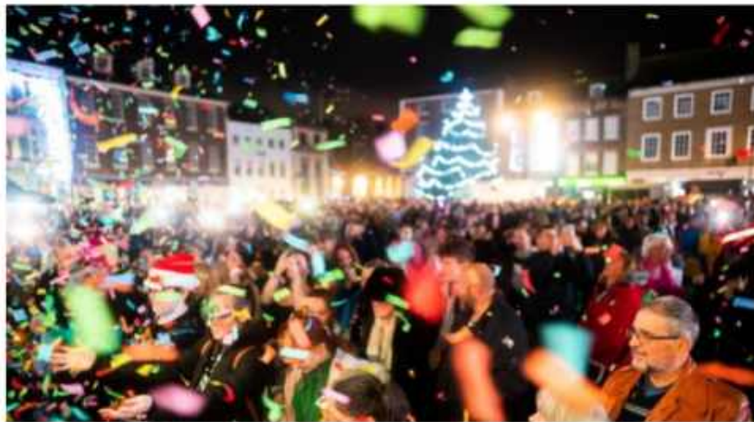
King's Lynn Christmas Lights switch-on

Sunday 26 November, Tuesday Market Place